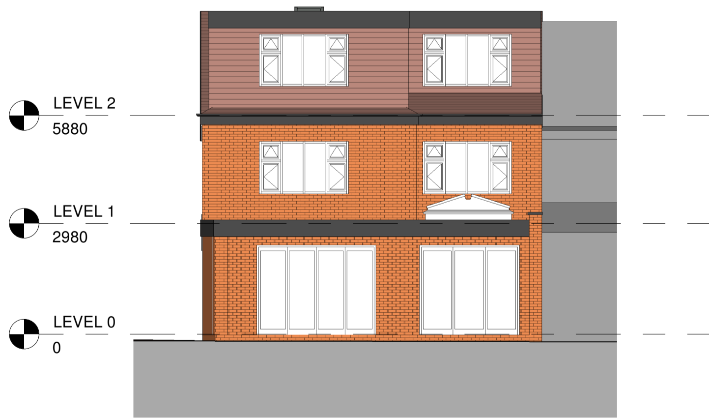
3 Rear - Proposed 1 : 100