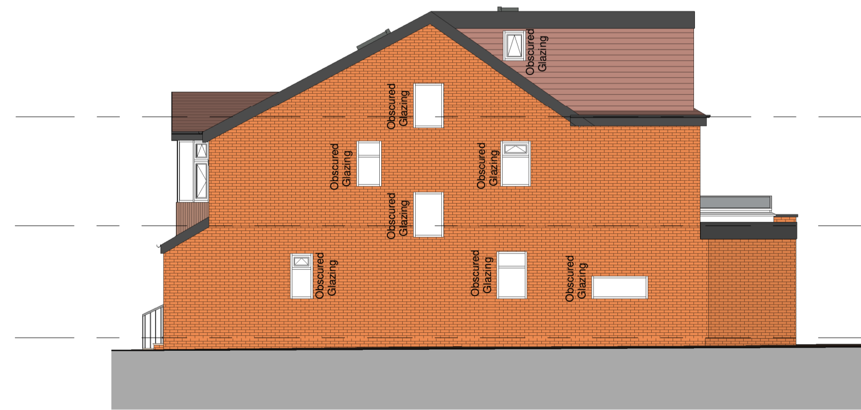
4 Right Side - Proposed 1 : 100