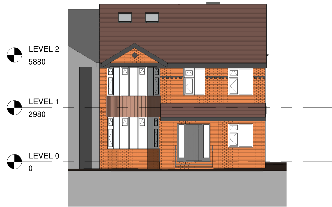
1 Front - Proposed 1 : 100