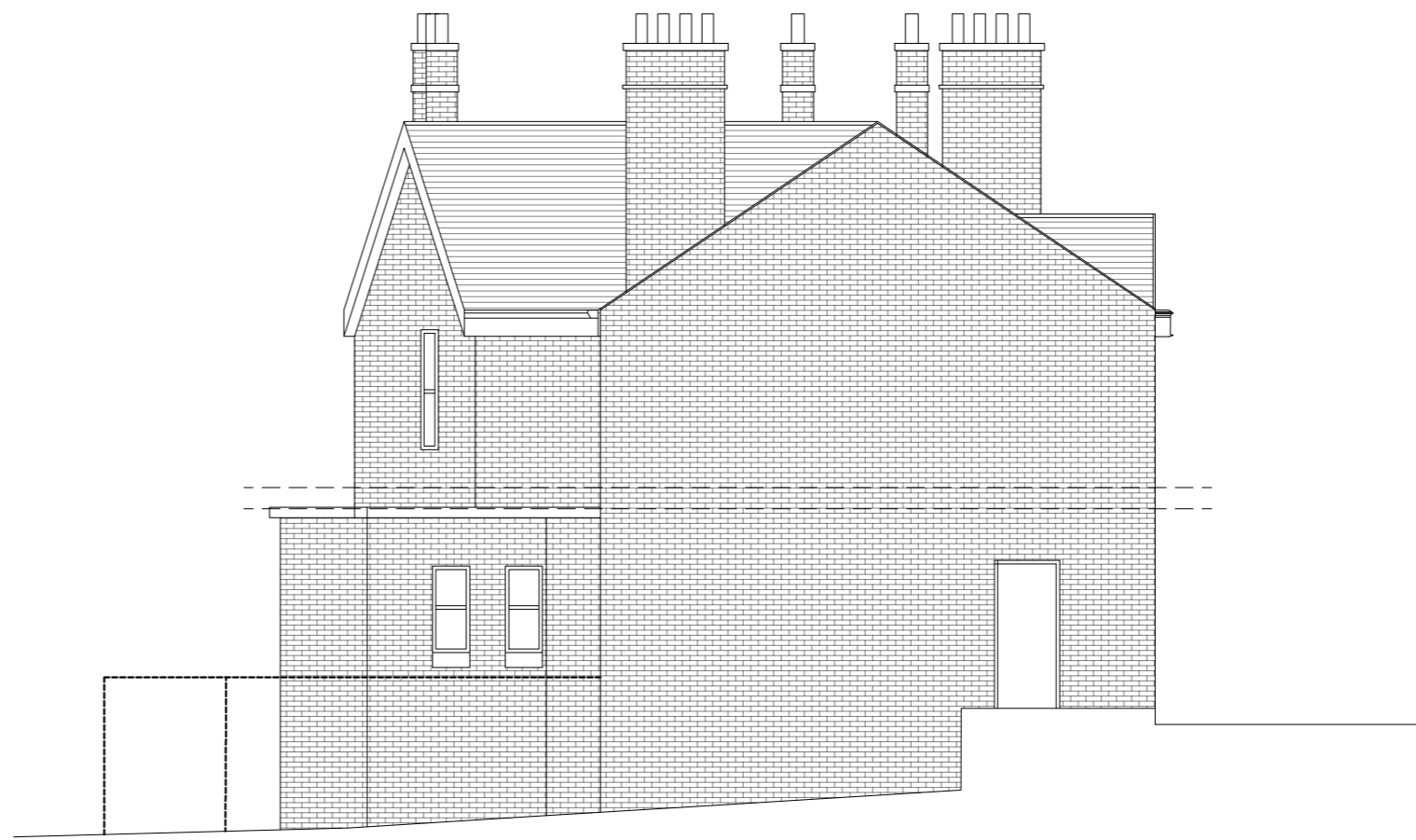
04 Existing GA Elevation D Scale 1:100 @ A2