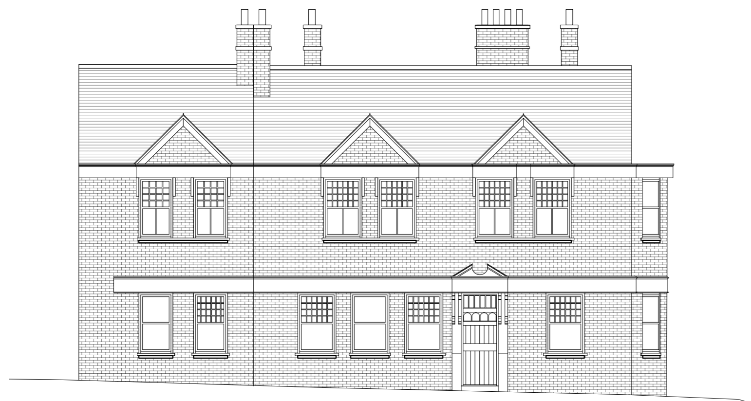
01 Existing GA Elevation A Scale 1:100 @ A2