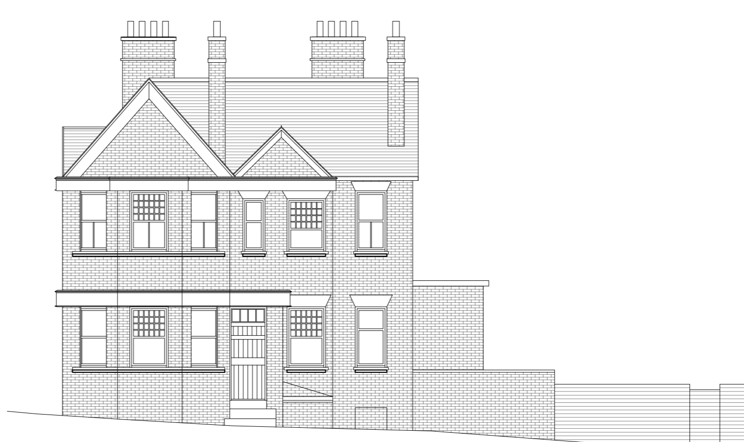
02 Existing GA Elevation B Scale 1:100 @ A2