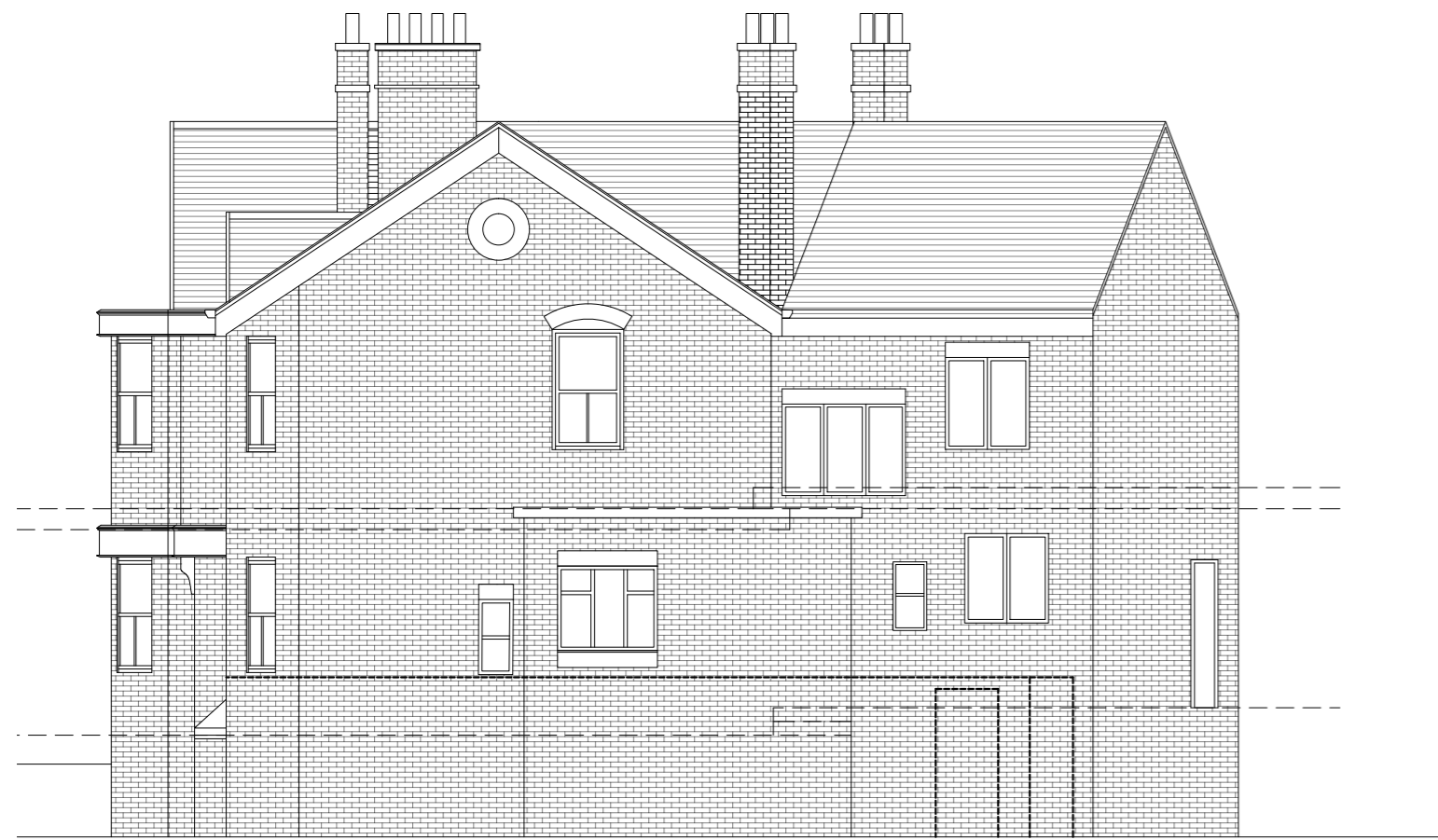
03 Existing GA Elevation C Scale 1:100 @ A2