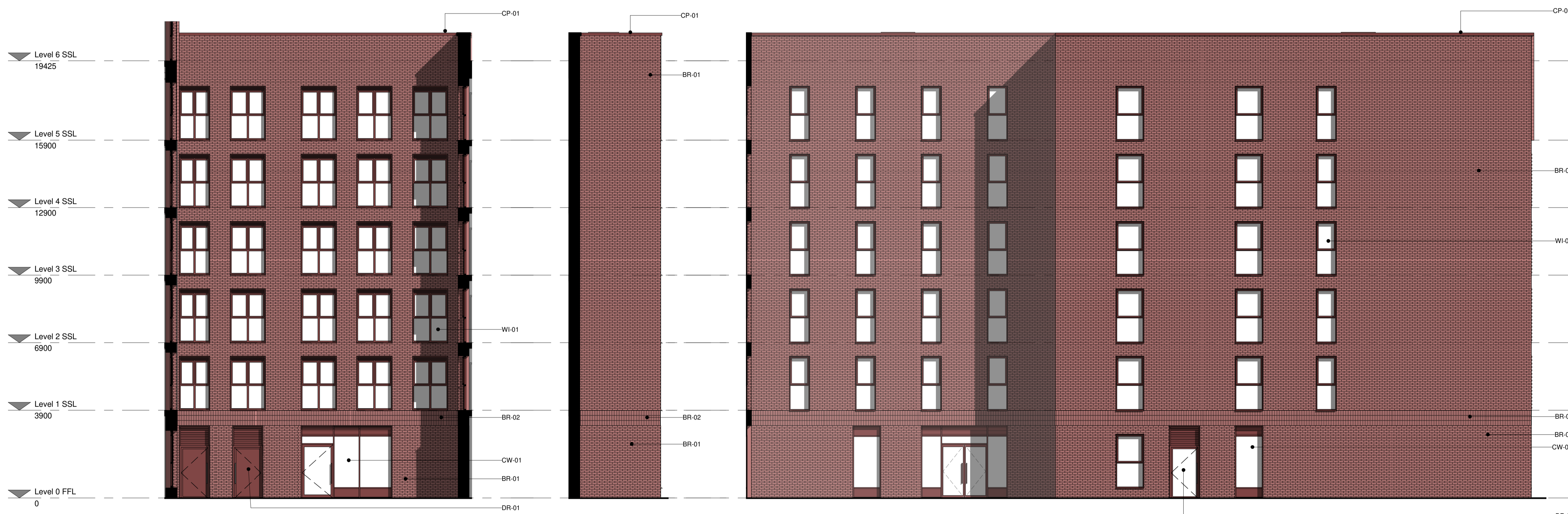
A Elevation A 1:100