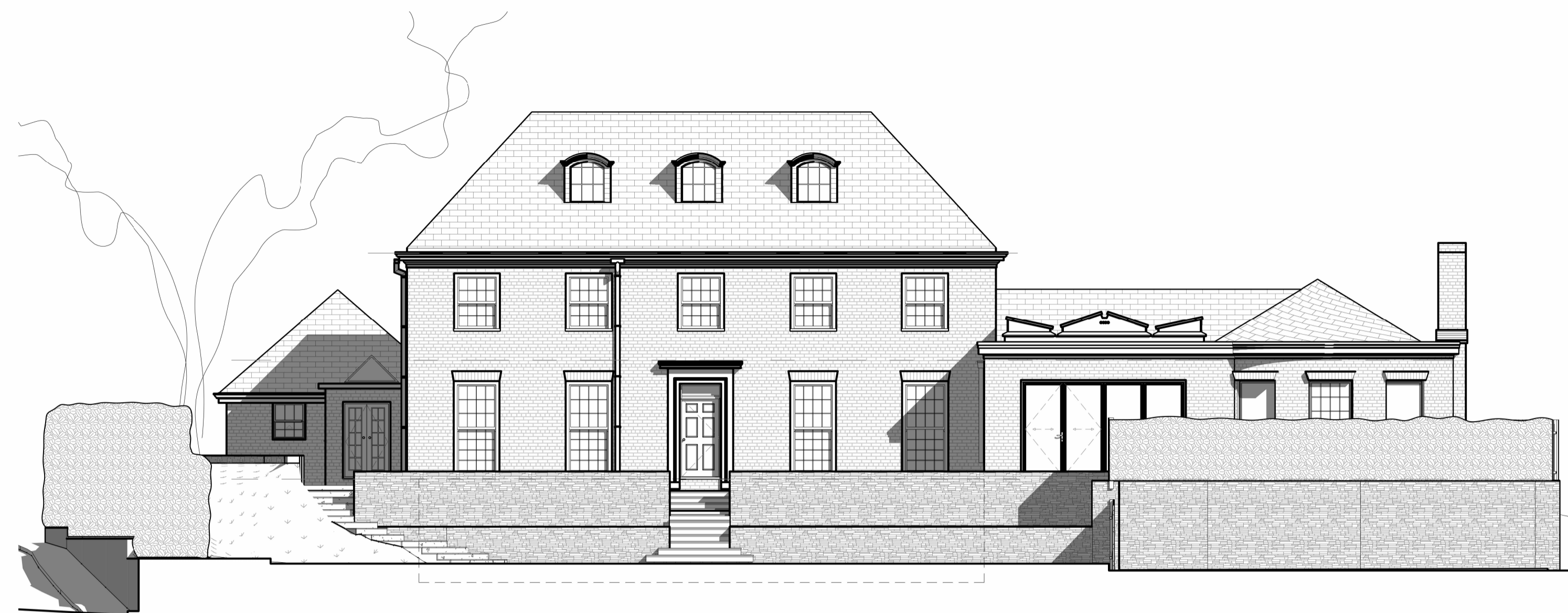
1 East - Existing 1:100