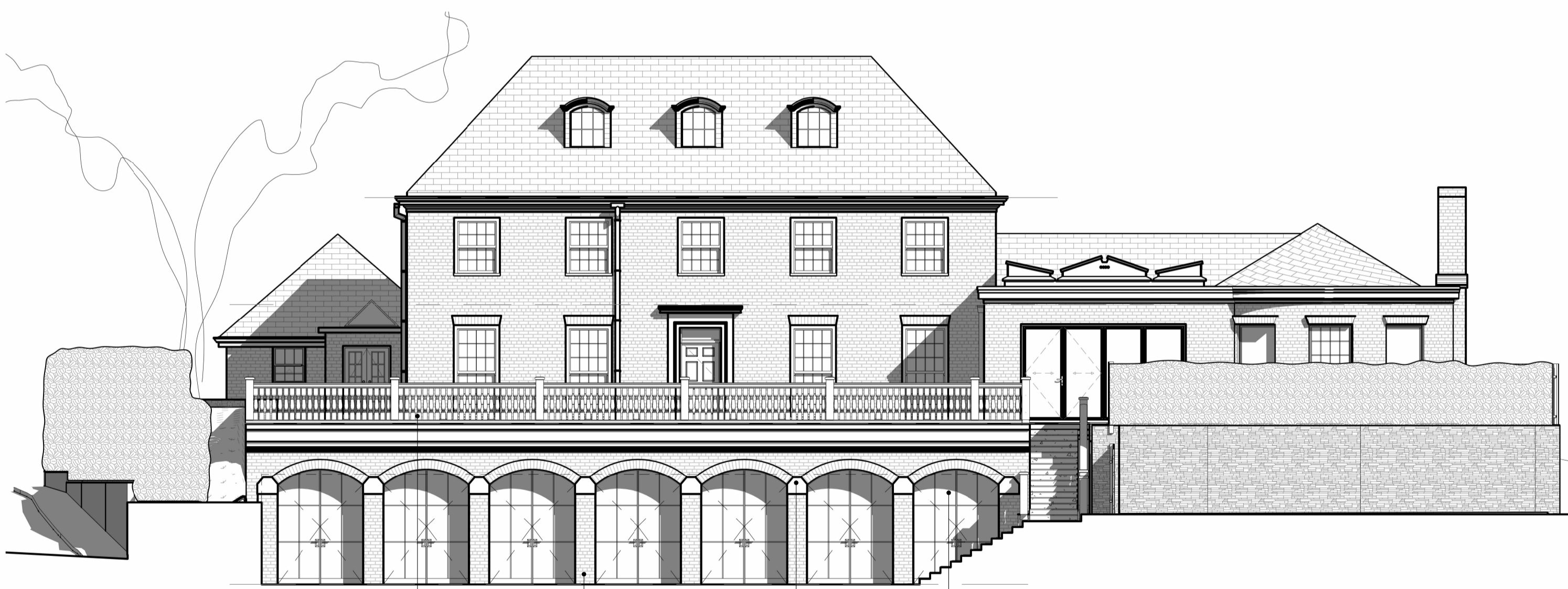
2 East - Proposed 1:100

Smooth Portland cast-stone balustrade Shropshire red creased facing brick Smooth Portland cast-stone arch impost White Georgian bar arched doors