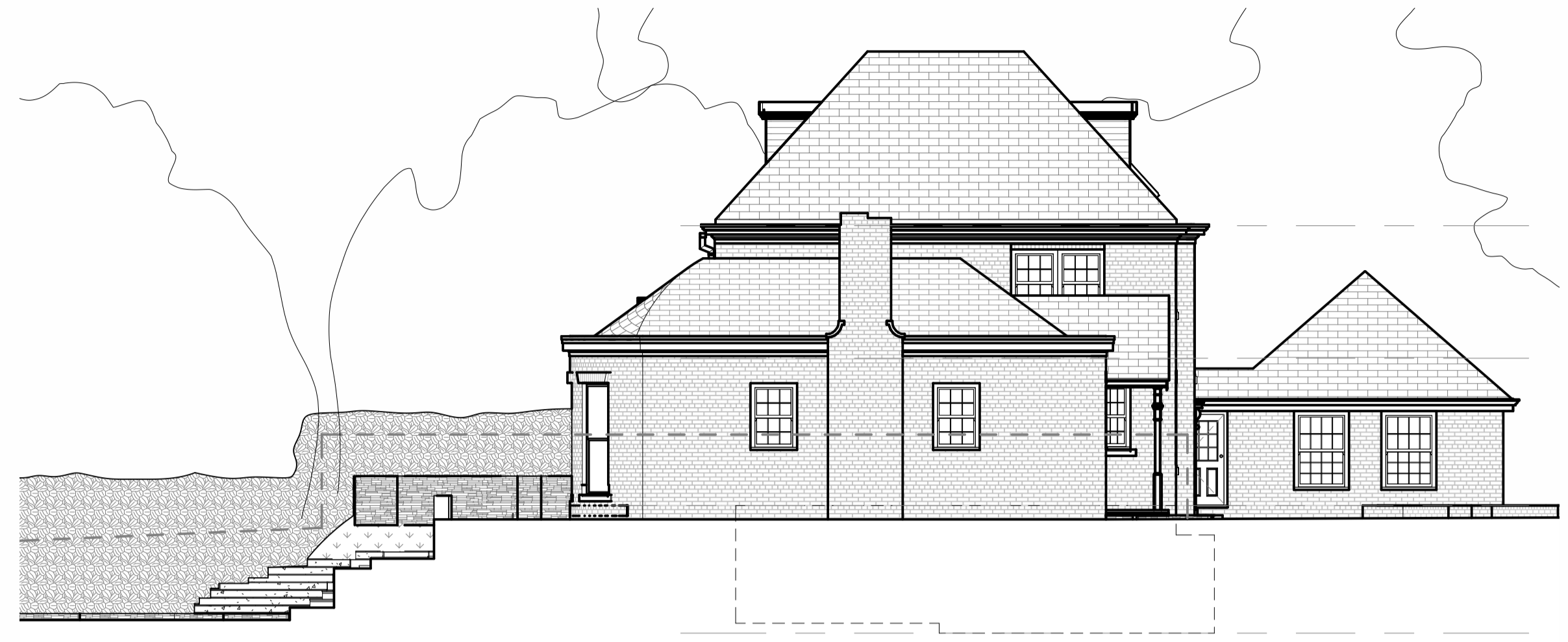
3 North - Existing 1:100