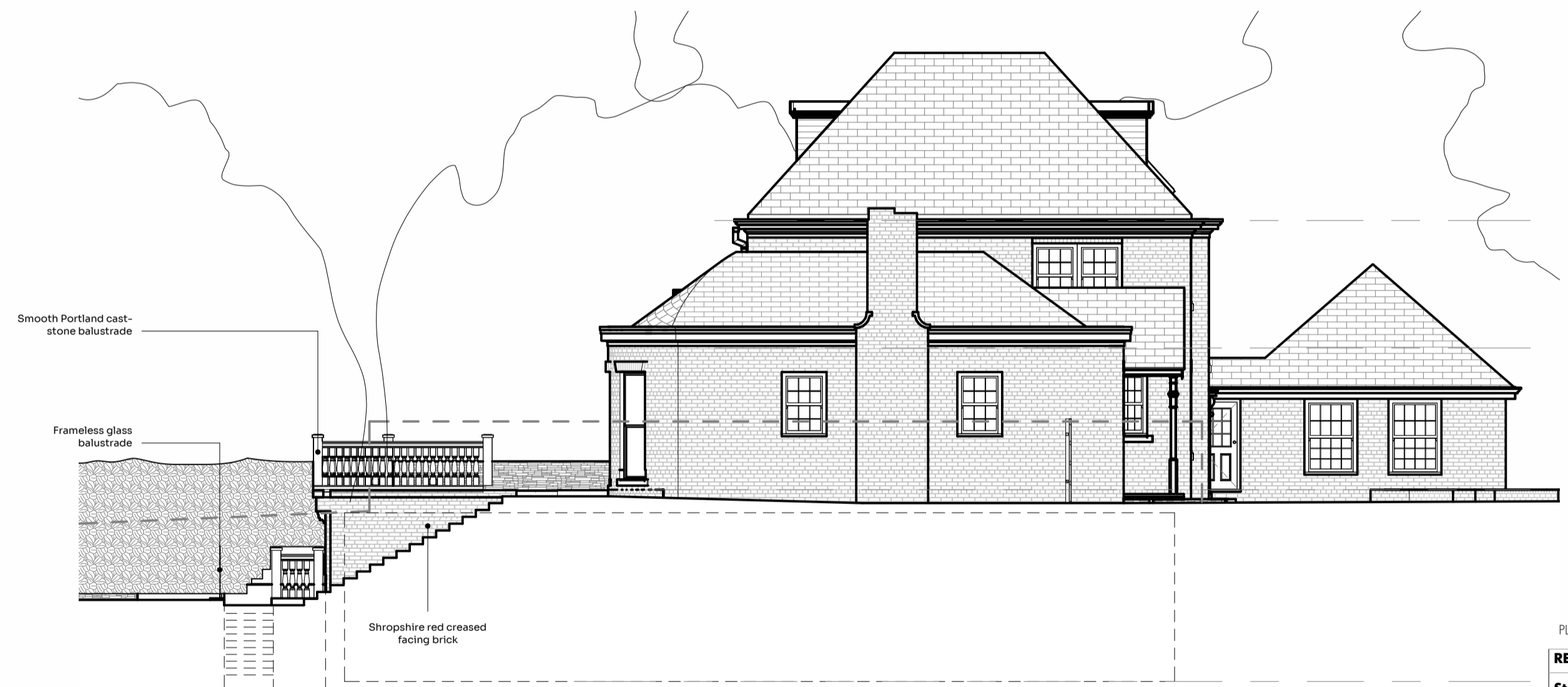
4 North - Proposed 1:100

Smooth Portland cast-stone balustrade Shropshire red creased facing brick Smooth Portland cast-stone arch impost White Georgian bar arched doors