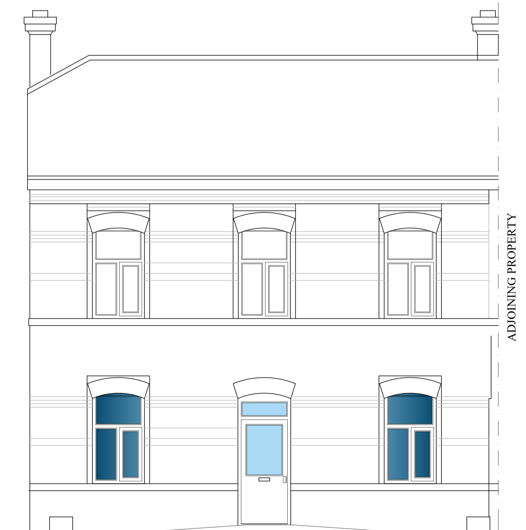
PROPOSED FRONT ELEVATION (SCALE 1:50)