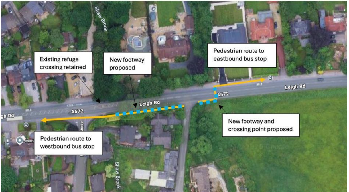
Figure 2.1: Summary of Pedestrian Infrastructure & Bus Stop Routes from Development