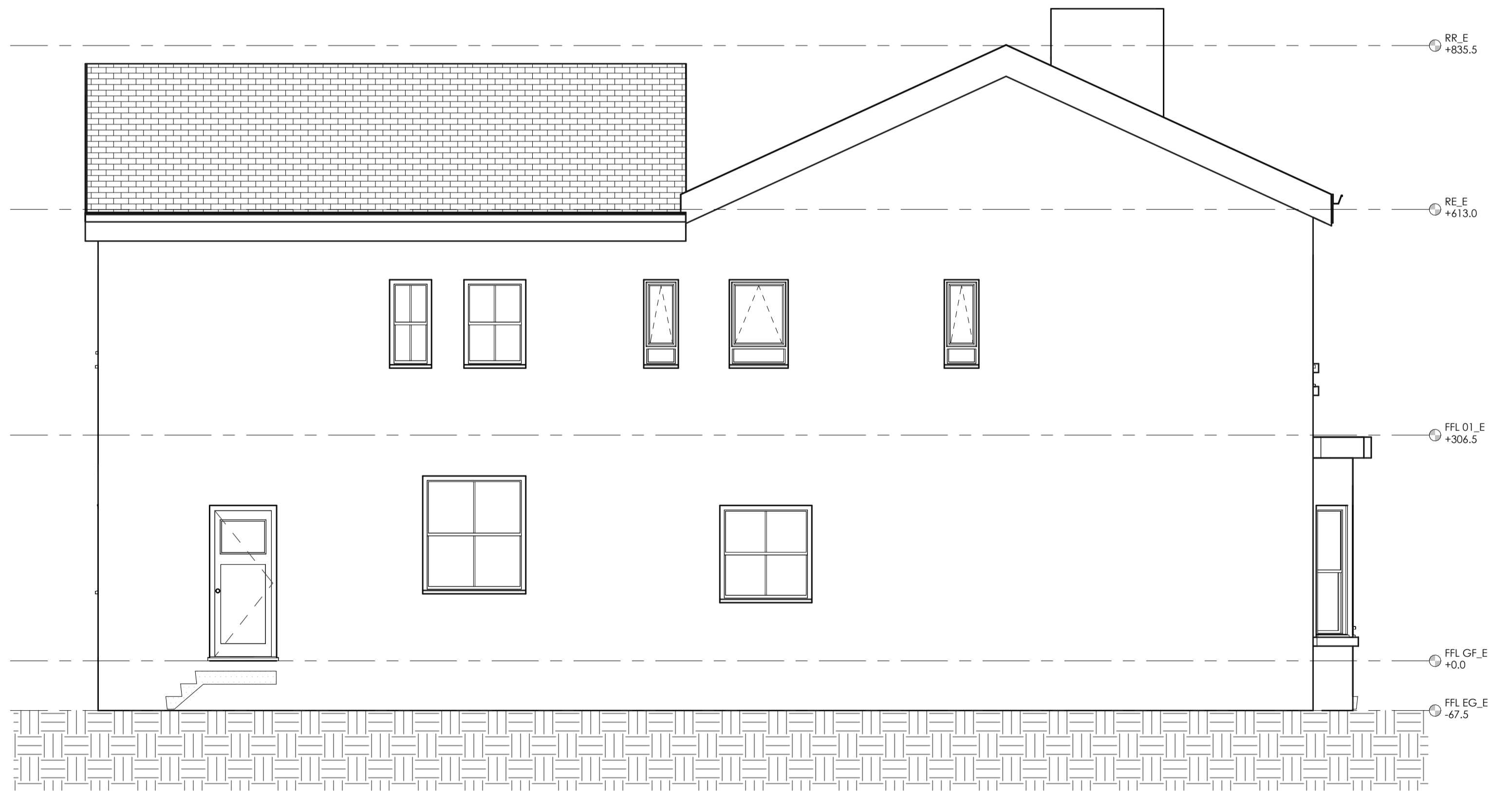
SIDE ELEVATION (80) Scale 1:50

DO NOT SCALE THIS DRAWING. CHECK ALL DIMENSIONS ON SITE. This drawing is to be used in conjunction with all relevant specifications and drawings issued. The contractor is to check and verify all dimensions and details before and after construction and check levels before work commences and/or during the process. Any inaccuracies must be reported to the Contract Administrator (Obsidian Design & Build) immediately. This drawing may not be reproduced, or part reproduced without the express consent of Obsidian Design & Build Ltd. This document should not be relied on or used in conjunction with any other drawings or specifications. Obsidian Design & Build Ltd accepts no responsibility for this document to any party other than the person to whom it was communicated. As built drawings prepared by Obsidian Design & Build Ltd based on information provided by any third party. Obsidian Design & Build Ltd accepts no liability for the accuracy or completeness of this drawing. THIS DRAWING IS COPYRIGHT © Obsidian Design & Build Ltd