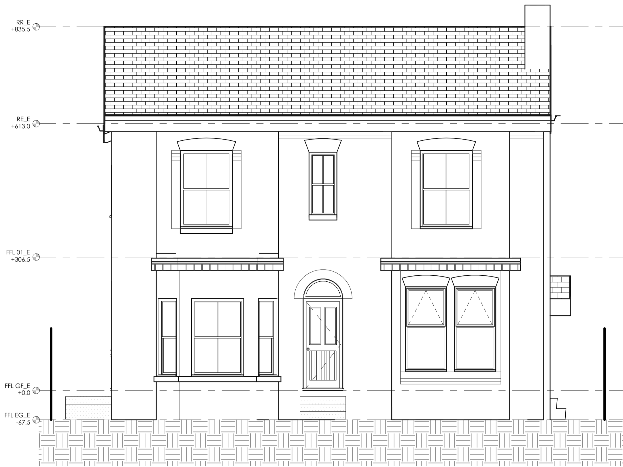
FRONT ELEVATION Scale 1:50