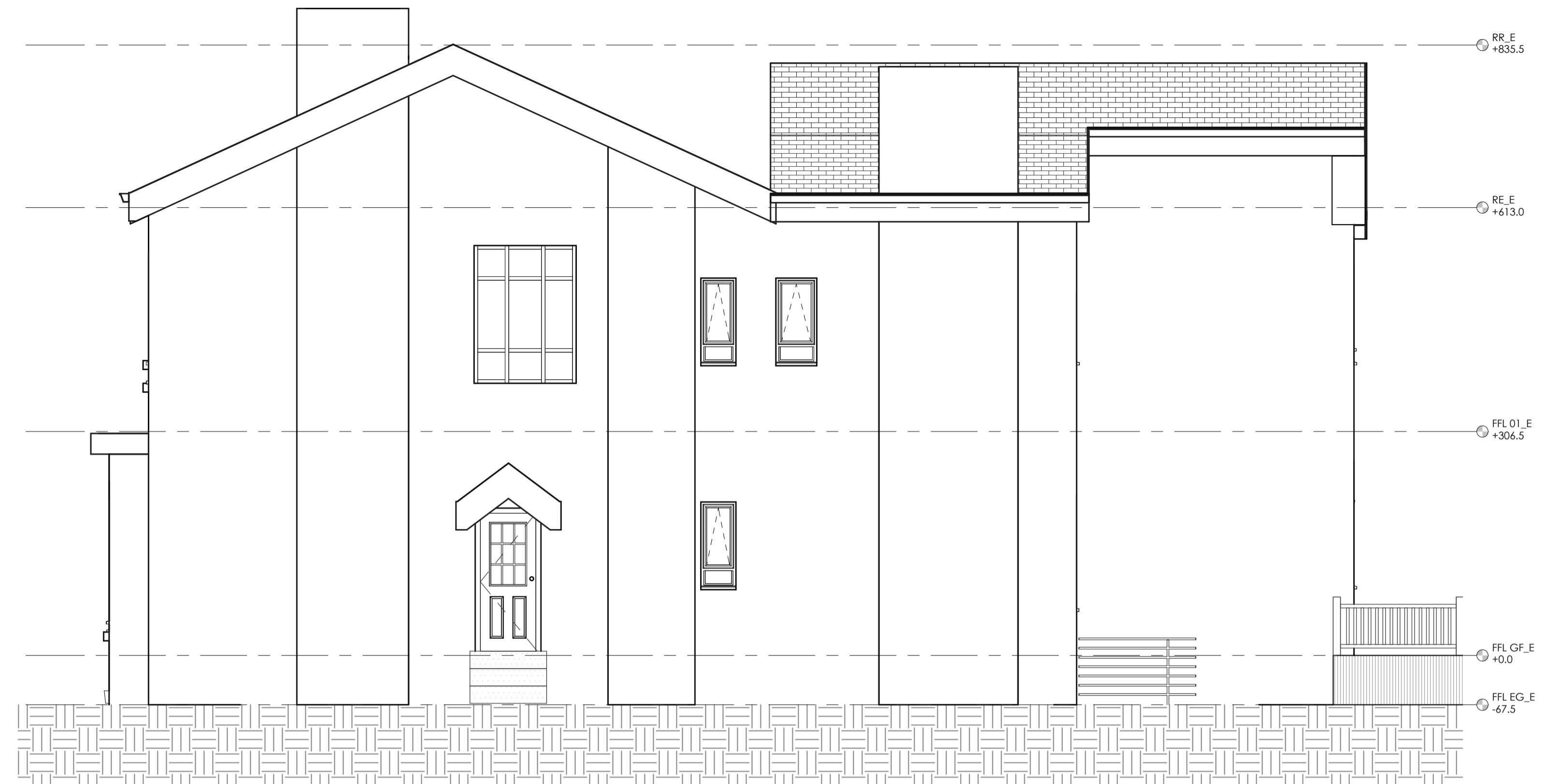
SIDE ELEVATION (84A) Scale 1:50