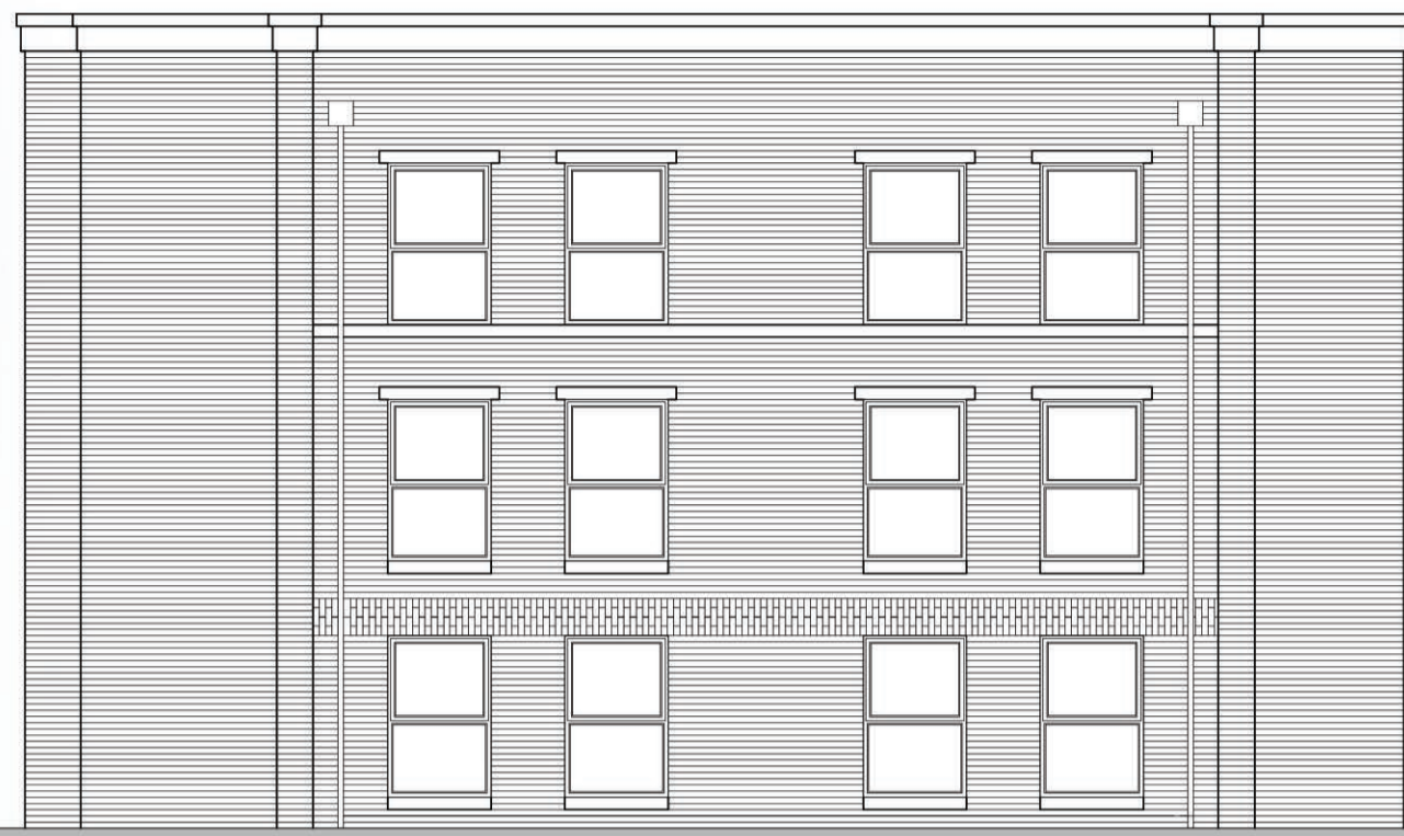
SIDE (ALEXANDRA ROAD) ELEVATION