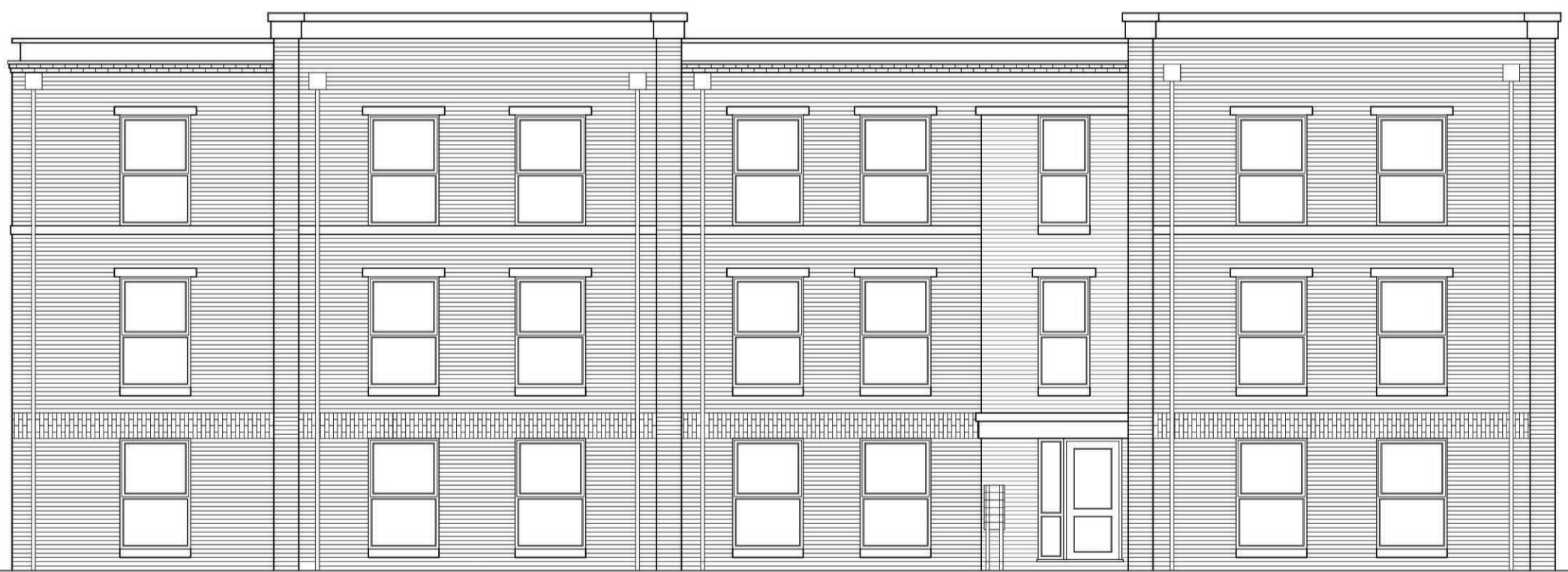
REAR (CAR PARK) ELEVATION