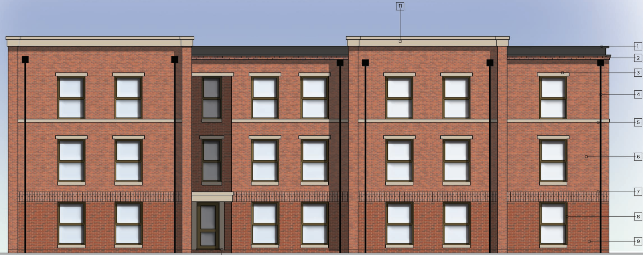
FRONT (LIVERPOOL ROAD) ELEVATION