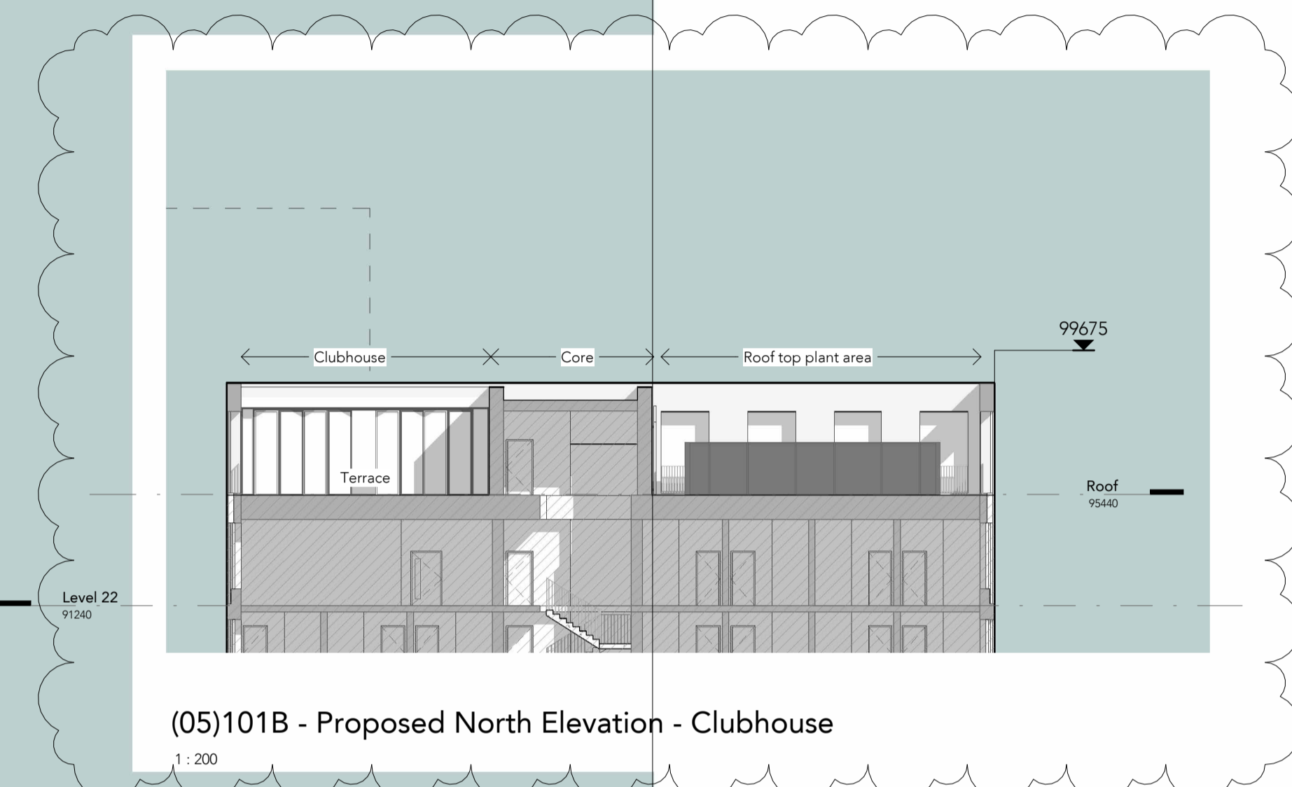
(05)101B - Proposed North Elevation - Clubhouse 1:200